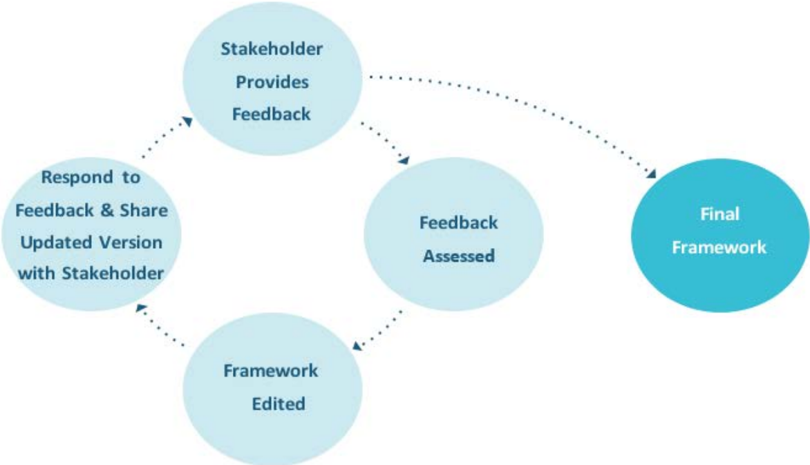
Figure 3. Review Process